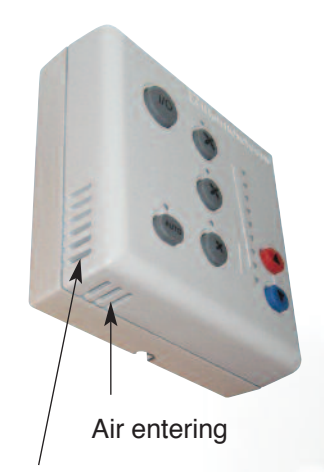
Built in thermistor temperature sensor

If temperature sensing remote to the air curtain is not required, the temperature sensor within the air curtain can be extended to sense the air curtain's return air temperature.